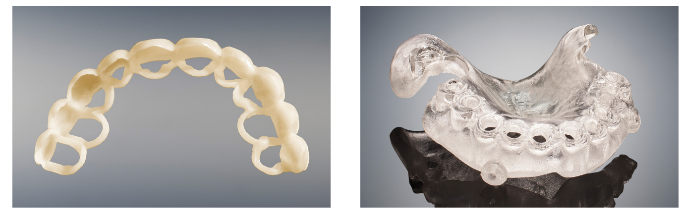
Figure 5. VeroGlaze, left, produces functional dental veneer try-ins, while Bio-compatible, right, is approved for direct skin and short-term mucosal-membrane contact.

Bio-compatible material is used by both medical and dental professionals when the 3D printed part will have bodily contact. It has five approvals: cytotoxicity, genotoxicity, delayed type hypersensitivity, irritation and USP plastic class VI. With these approvals, Biocompatible material can be used for direct skin (more than 30 days) and short-term mucosal-membrane contact. Please check each medical material for its specific bio certification.