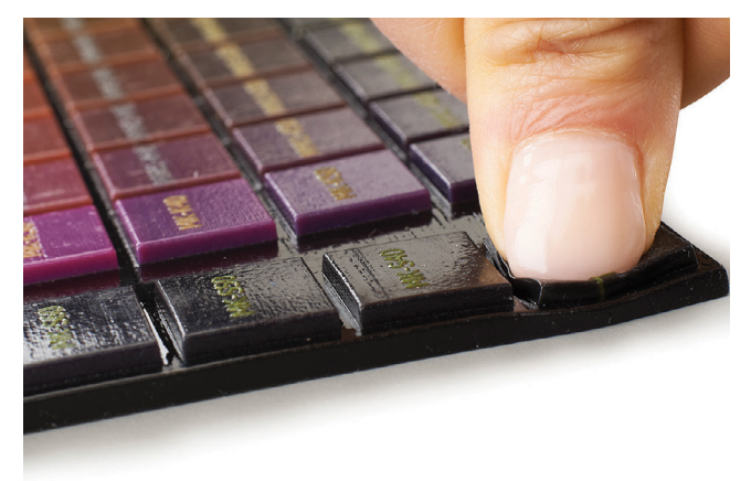
Figure 8. Various colors and Shore A values are displayed on this palette.

This range of rubber-like properties is unrivaled in the 3D printing industry. With it, designers and engineers can match the flexibility of production elastomers or test a number of slightly different options to find just the right feel (Figure 8).