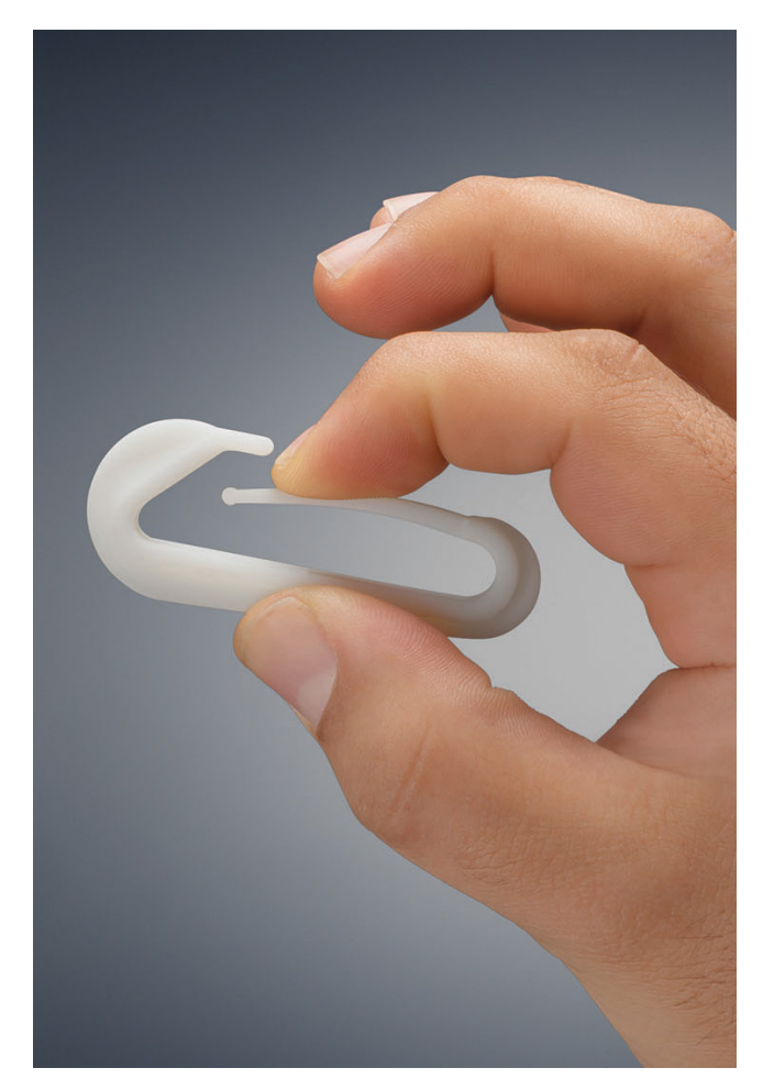
Figure 3. Rigur material was engineered for prototyping polypropylene products.

This PolyJet material has been formulated for improved dimensional and visual characteristics as well as greater strength. Parts made from Rigur are bright white (Figure 3) and have better surface finishes than Durus. This makes Rigur great for visual applications, and its higher temperature resistance (three times that of Durus) and strength (twice that of Durus) make it a good choice for form, fit and light functional testing of parts that will be produced in polypropylene.