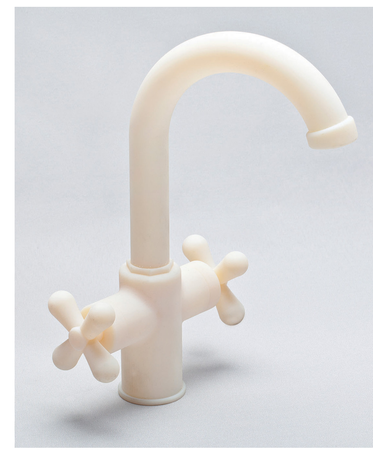
Figure 6. High Temperature material can withstand hot fluids.

High Temperature is a wise choice for functional testing with hot air or water, such as evaluations of plumbing fixtures and household appliances (Figure 6). Temperature resistance may also be a consideration for show pieces that will endure intense, hot lights. If temperature isn't a consideration, High Temperature may be a good choice for prototypes that need very high stiffness and strength.