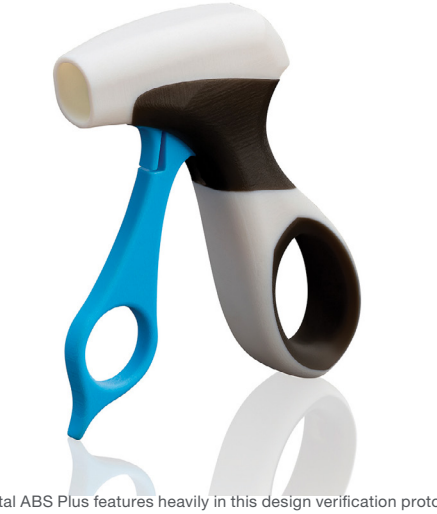
Figure 7. Digital ABS Plus features heavily in this design verification prototype for medical devices. This surgical prototype also features Agilus30 overmolding in black for superior grip and a 3D printed color handle, printed separately. Digital ABS Plus has heightened impact strength from Digital ABS, leading to improved functional performance.

Digital ABS Plus extends the simulation of engineering thermoplastics beyond the thermal resistance, toughness and transparency of High Temperature, Rigur and VeroClear. Digital ABS Plus is an advanced version of Digital ABS™, improving on the original material's impact strength. As its name indicates, this material closely approximates ABS. Compared with the averages for ABS<sup>1</sup>, Digital ABS Plus has the same or higher values for strength, flexibility, durability and heat resistance. Its impact resistance is below average for ABS<sup>1</sup> but still within the range of all ABS offerings, and more than three times that of Vero.