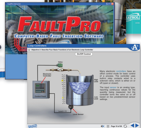
Interactive Multimedia, FaultPro, and Student Reference Guides