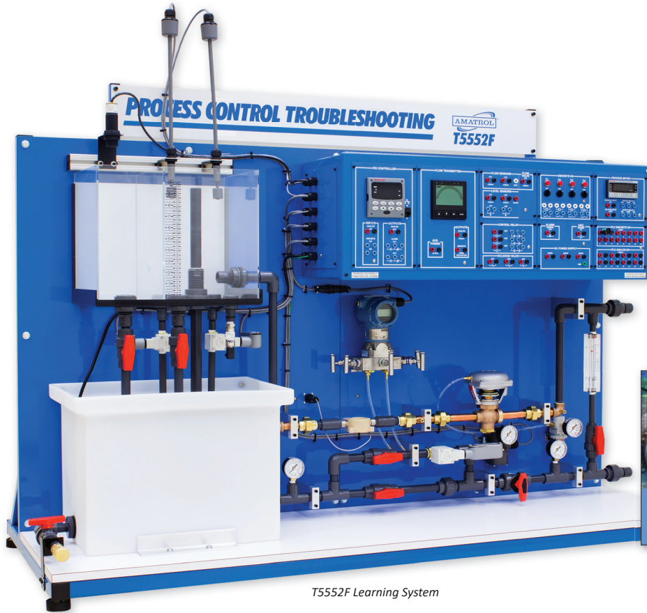
T5552F Learning System