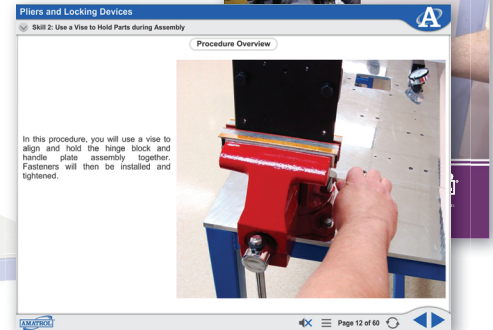
Interactive Multimedia Curriculum and Student Reference Guide